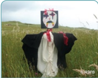
Winning scarecrow from South Uist Workshops.