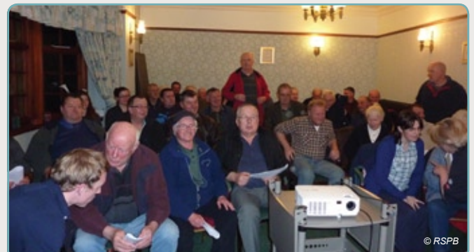
Crofters relax after the meeting at the Dark Island Hotel.

We held a public meeting on Thursday 27th from 7-10 pm at the Dark Island Hotel. This was an opportunity to give and receive feedback on our work across the Uists and to discuss with crofters and other members of the public how the project is progressing. We were particularly keen to get people’s ideas on key issues including the best way that we can help townships with the collection of seaweed this winter, our proposals to acquire new machinery, the crop protection scheme and how machinery may be managed after the project has ended in 2014.