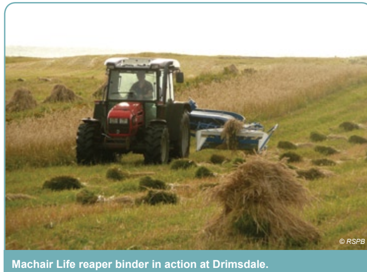
Machair Life reaper binder in action at Drimsdale.

We harvested eight hectares of corn with the binder from Barra to Berneray on crofts where we had Management Agreements. We were particularly excited about the use