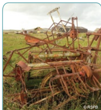
We will be assisting with the repair of old binders next year.

Next year we will be demonstrating the new binder at events across the island. If you would be interested in seeing the binder in action or in having your crop harvested with it next year and are not currently in a management agreement with the project, please contact us to discuss the options.