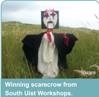
Winning scarecrow from South Uist Workshops.