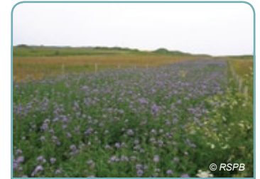
Phacelia cover crop on Coll.

proved to be good early cover. A male comcrake spent the entire spring calling from a Brassica patch approximately 6x40m. The seed mix of Phacelia and Brassicas has proved to be so great for wildlife that it is now going to be used in the majority of comcrake cover corridors on the reserve.