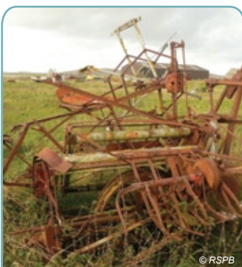
We will be assisting with the repair of old binders next year.

Next year we will be demonstrating the new binder at events across the island. If you would be interested in seeing the binder in action or in having your crop harvested with it next year and are not currently in a management agreement with the project, please contact us to discuss the options.